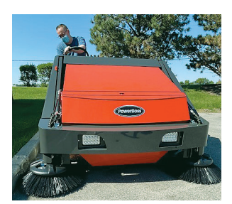
Ergonomics System Open cockpit with unobstructed view