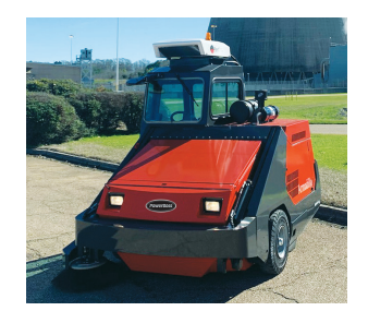
Operator and Environmental Safety Common industrial options to maximize utilization