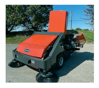
Maintenance Benefits Full engine access for easy serviceability